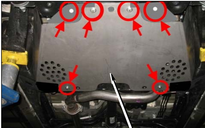
Kit Skid Plate Installed

NOTE: If equipped - Factory ENGINE SKID will require modifications to skid. Rear bolts may require shimming.