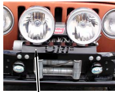
Multi-Light Mount (Kit # 87011)

Four holes on the front of the kit bumper will accommodate a Hi-Lift jack, a Multi-Light Mount, or both.